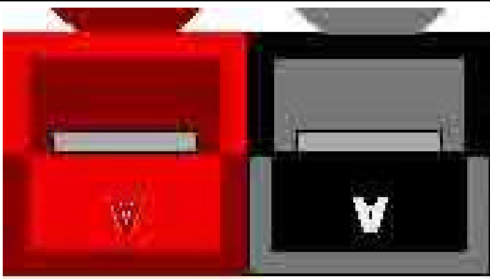
+13.8 VDC - COMMON Fig 2 – A Front View of Anderson Connectors with RED 12V connector on left, when the front lip (contact-protector) is on the bottom of housing.