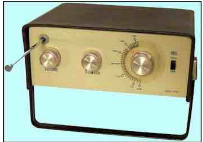
Figure 1: The GR-98 Air-Band AM VHF Monitor

http://www.w6ze.org/Heathkit/Heathkit_Index.html