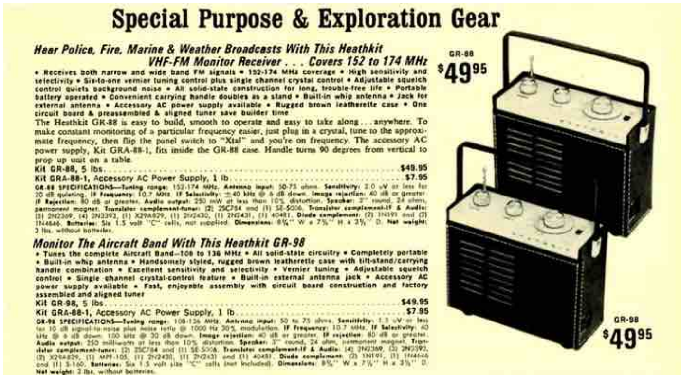
Figure 3: Ad from Winter 1970 Heathkit Catalog showing the GR-88 and GR-98.

Evidently Heath was not satisfied and during production the circuit was changed. The voltage at the junction of R23 and R24 is still connected to the tuner RF Amplifier, but first the voltage is dropped about 0.6 volts by D5, controlling the RF Amplifier but at an overall higher gain. Q14 was replaced with a PNP transistor (2N2431) and its base connects to the same R23, R24 junction of the voltage divider. The collector is grounded. As the base voltage to Q14 goes less positive, Q14 draws more current. This current is supplied by R2 and R8, the base resistors for the First IF Am-