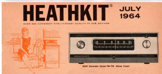
Figure 3: Heathkit's New AJ-13 FM Stereo Tuner on the Cover of the July 1964 Catalog

control is a volume control instead of the power and mode switch. The AJ-63 uses 5 tubes and has a connector on the back so it can be used with the AC-11B Stereo Multiplex Converter (See HOM #45). While the AJ-43 sells for $10 less than the AJ-13 the AC-11B costs $24.95. The 'B' signifies a tan cabinet which matches the AJ-63; ('A' is black).