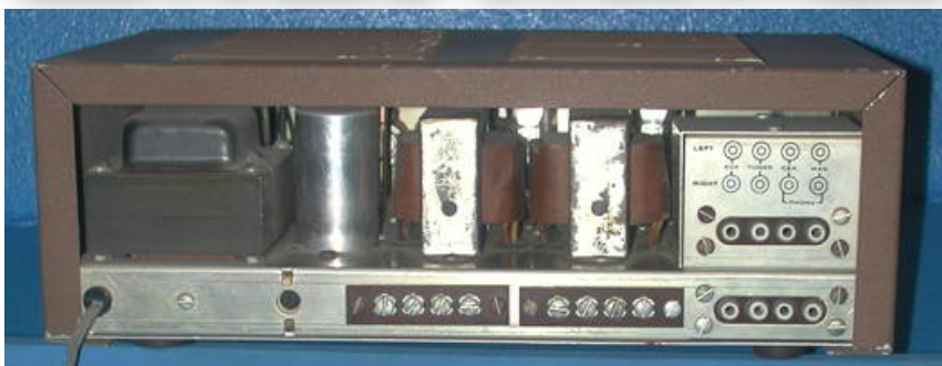
Fig. 2: Heathkit AA-32 Stereo Amplifier - Rear View

AUX connectors. these connectors are all RCA type phono jacks. Once the AC line is connected your unit is ready for use.