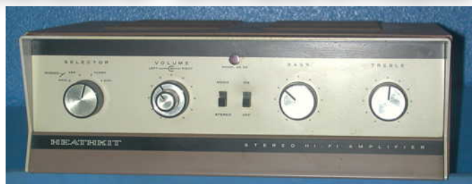
Fig. 1: Heathkit AA-32 Stereo Amplifier

Over the years Heathkit has manufactured a large number of Hi-Fi kits including tuners, amplifiers, receivers (combined tuner and amplifier), speakers, tape decks and turntables. In 1964 they introduced a new line of lower-cost tube Hi-Fi equipment that they called the Designer-Styled series. This equipment came in a “mocha brown and beige with black accents” color scheme. Two kits were originally introduced, the AJ-13 FM/FM Stereo tuner and the AA-32 Stereo Amplifier. They appeared, marked as NEW, in the July 1964 Heathkit catalog 800/47. The kits originally sold for $49.95 and $39.95 respectively. Later in 1964, four more Hi-Fi kits were introduced with the same styling, the AJ-53 Hi-Fi AM Tuner, the AJ-63 FM Mono Tuner, the AA-13 14-watt Mono Amplifier and the AA-23 25-watt Mono Amplifier. The AA-13 was noted as “LAST CALL”