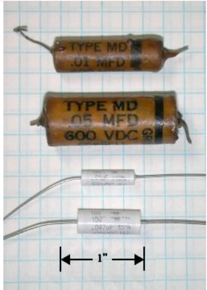
Figure 3: Old and new style tubular capacitors (see text).

Figure 3 shows two old capacitors from the NC-173 receiver and their modern replacements - all manufactured by Cornell Dubilier. The top two are older 0.01 \mu\text{F} and 0.05 \mu\text{F} 600 VDC MD series paper and wax capacitors. The bottom two capacitors 0.01 \mu\text{F} and 0.047 \mu\text{F} at 630 VDC Type 150 metallized polyester. The new capacitors take up about 1/4 the chassis area and 1/8 the volume.