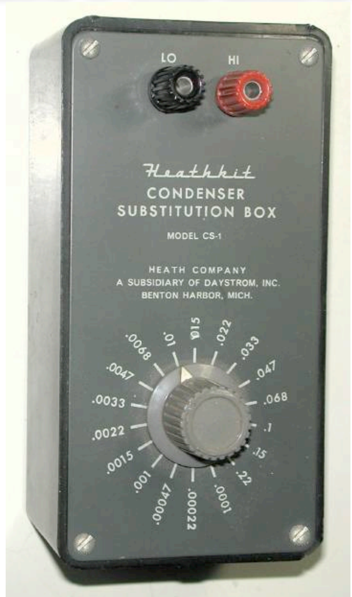
Figure 1: Heathkit CS-1 Condenser Substitution Box set for 0.01 μF

Prior to the mid-sixties “capacitors” were known as “condensers”. The name change occurred because engineers and scientists decided that “capacitor” was more descriptive;