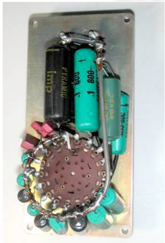
Figure 2: Heathkit CS-1 Condenser Substitution Box Interior

The binding posts on the CS-1 are red and black indicating polarization. While the capacitors are not really polarized, many tubular capacitors need to be installed in the circuit in the proper direction for best performance. This is due to the construction of those tubular capacitors; they are assembled such that one side of