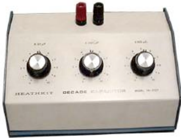
Figure 4: Heathkit Decade Capacitor Box Model IN-3127

Remember, if you are getting rid of any old Heathkit Manuals or Catalogs, please pass them along to me for my research.