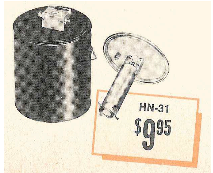
Older Heathkit HN-31 'Cantenna' from the March 1965 Heathkit Factory Catalog. Note the lack of graphics on the can.

In 1961 Heathkit, using its quantity buying power, introduced the HN-31 Cantenna dummy load. The Cantenna was well received by the ham community because of its low price and high performance. It can handle a full kilowatt for up to 9-10 minutes, depending upon the cooling oil used. The SWR remains under 1.5: 1 at frequencies up to 450 MHz. When originally introduced the Cantenna was priced at $9.95.