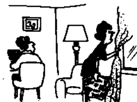
"Well, you ought to reach Jimmy Wilson now... our antenna just fell through his roof."