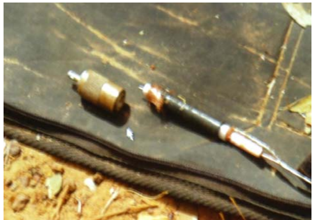
“The French Connection” Antenna Problem

labeled “The French Connection”, seen below.