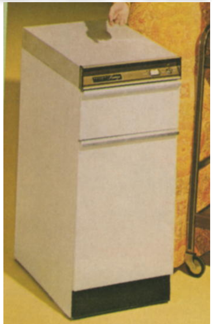
Figure 1: Heathkit GU-1800 Trash Compactor

Heathkit introduced the GU-1800 in late 1971, see Figure 1. An ad appeared in the October issue of Popular Science of that year announcing