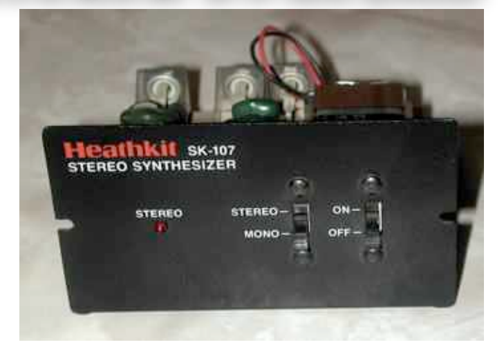
Figure 1: Heathkit SK-107 Stereo Synthesizer, less optional SK-99 cabinet.

The SK-107 is based on the Philips TDA3810 spatial, stereo and pseudo-stereo sound integrated circuit. This chip was introduced in 1985 and, to the best of my knowledge, Heathkit introduced the SK-107 in 1987 or 1988. The earliest catalog I have that shows the low cost SK-107 is the winter 1989 catalog (#215). At that time it sold for $16.95. The price increased to $19.95 in the spring 1989 catalog (#216), and remained there until Heathkit shutdown all their kit activities except for their educational products. The SK-107 came less a cabinet which sold separately. The cabinet, model# SK-99, sold for $6.95. The SK-107 is powered by either an internal 9-volt battery, or their PS-2350 Battery Eliminator ($7.95).