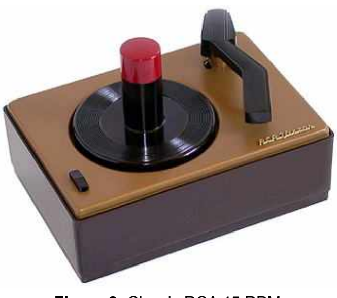
Figure 2: Classic RCA 45 RPM Record Changer

Figure 3 shows the SK-107 stereo synthesizer listing from the spring 1989 catalog. Figure 4 show the optional cabinet that is available and fits the SK-107 as well as the SK-104-H 1-watt audio amplifier.