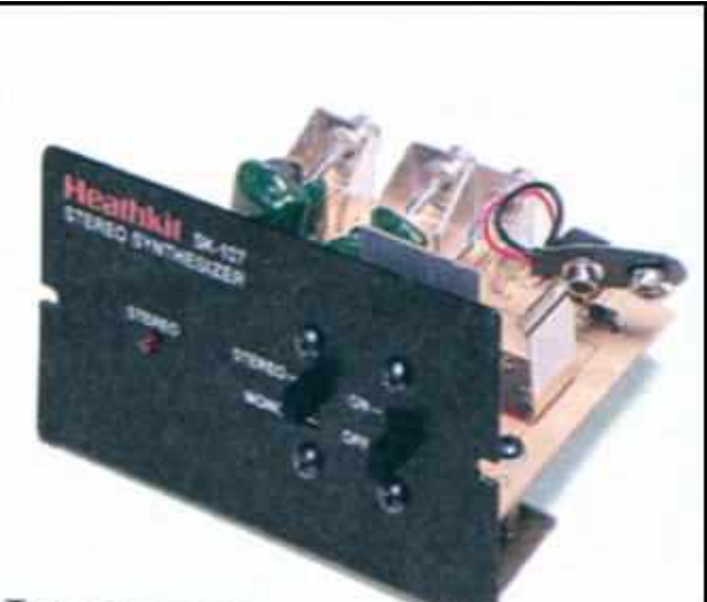
Figure 5 shows a top view of the stereo synthesizer. Power is provided by a standard 9-volt NEDA 1604 battery that mounts, by metal clip, to the circuit board. The heart of the kit is the 18-pin TDA3810 DIP integrated circuit (left of center) that mounts in a socket. Four of the capacitors are electrolytic capacitors; two perform operations internal to the chip, and the

meaning they are simple kits, easily assembled in less than eight-hours and prior kit-building experience is not needed.