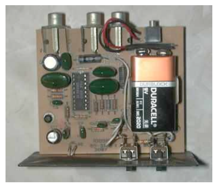
Figure 5: Top View of the Heathkit SK-107

adds a fair amount of listening enjoyment to those old recordings.