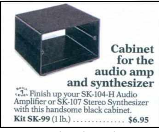
Figure 4: SK-99 Optional Cabinet Heathkit Catalog #216

other two couple the chip to the stereo output jacks. The remaining nine capacitors are radial lead mylar types. The resistors are all standard 1/4 -watt types except for R5 which is 1%.