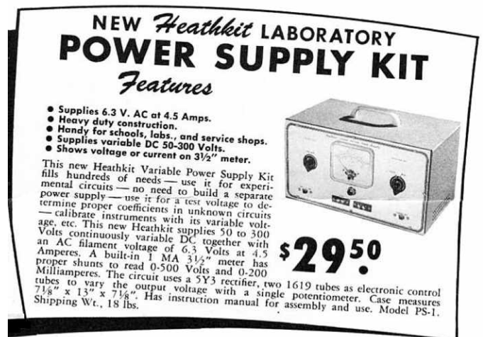
Figure 2: PS-1 Ad from 1951 Heathkit Flyer

Three tubes are used in the PS-1. A 5Y3GT rectifier tube and two paralleled 1619 series regulator tubes. The 1619 was a common tube that was mass produced during WWII. In 1971 TAB sold surplus 1619 tubes at 5 for a dollar. Heath probably obtained them at even a lower price. They might have been included in the mass surplus component buys Heathkit made in their early days. The 1619 has a 2.5 V filament requiring a separate transformer or isolated winding. Since the filament or cathode in these circuits is at a high voltage this requirement is universal across the various family of kits.