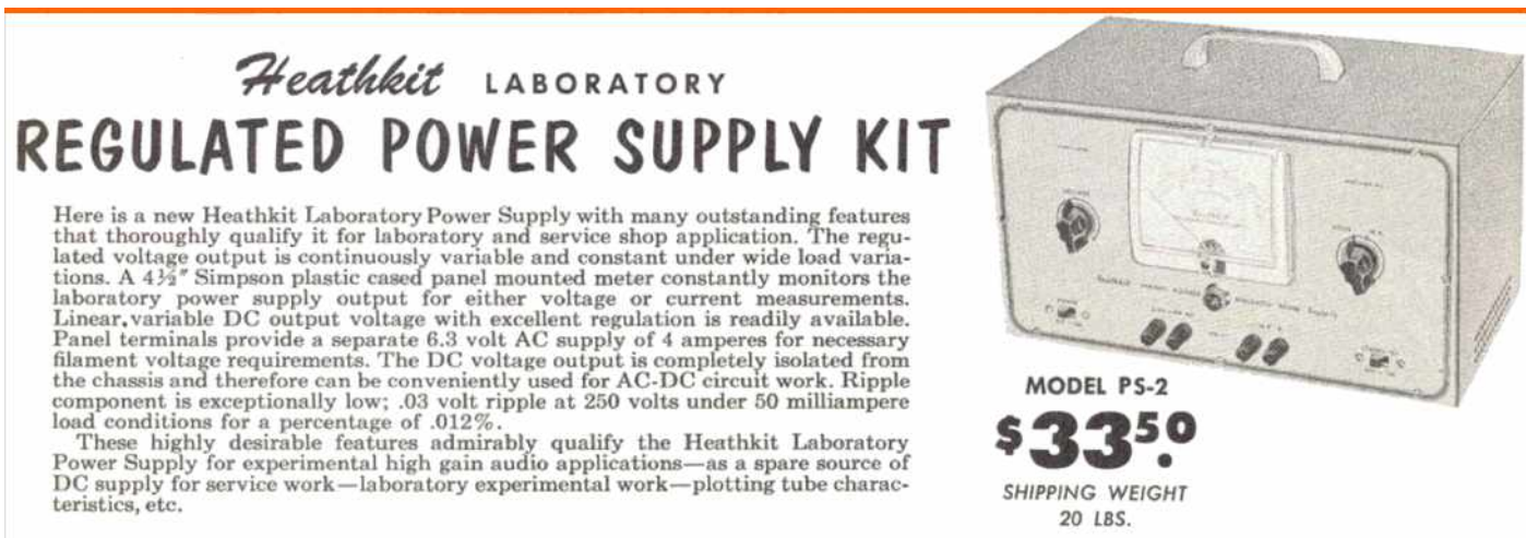
Figure 3: PS-2 Ad from the 1954 Heathkit Catalog

A pair of paralleled 1619 tubes remain as the series regulator tubes. The rectifier was upgraded to a 5V4, and a 6SJ7 control amplifier tube and an 0C3 voltage reference tube were