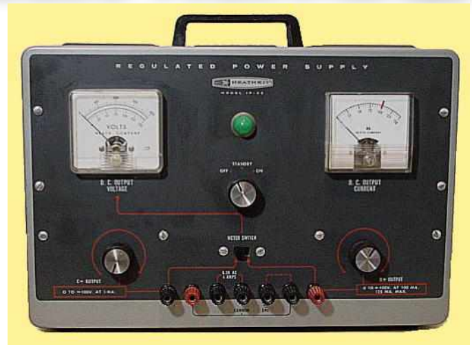
Figure 1: Heathkit IP-32 HV Power Supply

The PS-1 provides unregulated B+ voltage that is variable between 50 and 300 VDC. I could not find any specification for the maximum B+ current; however the meter is scaled for 200 ma full-scale, so 150 ma would be a good guess. The PS-1 also provides 6.3 VAC for filaments at a hearty 4.5 amperes. There is no bias voltage provision. In 1952 a change was made to the