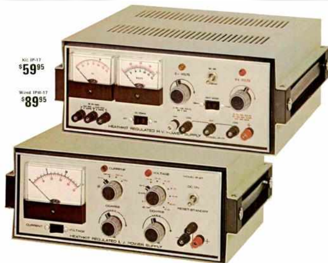
Figure 6: Heathkit IP-17 (top) shown with the IP-27 Low Voltage companion power supply (bottom) from the 810/68 1968 Catalog

The voltage of both the B+ OUTPUT and the C- OUTPUT is monitored on a 1 ma meter with the proper series resistors. A DPDT slide METER SWITCH selects the correct resistor and changes the meter polarity to read full-scale 0 to -150 volts on the C- OUTPUT ( R_{25} = 150\text{ K}\Omega 1%) and 0 to +400 volts on the B+ OUTPUT ( R_{24} = 400\text{ K}\Omega 1%).