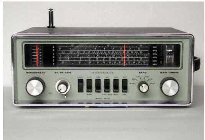
Figure 1: Heathkit GR-78 Portable SW Receiver

The GR-78 communications receiver, shown in Figure 1, comes in a reasonably small package for its day. It weighs 10 lbs. and measures just