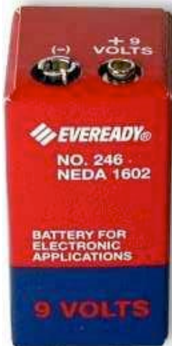
Figure 2: NEDA 1602

ual warns that the smaller metal batteries can also short out the circuitry. Figure 2 shows the Eveready 246 #1602 battery.