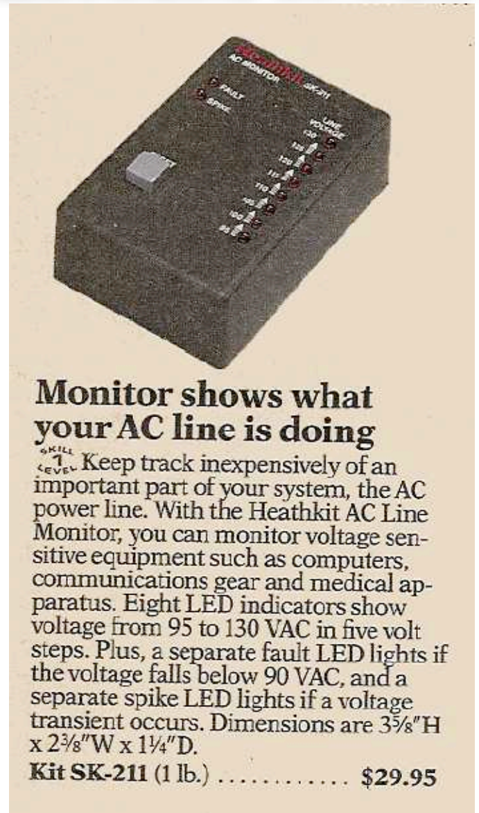
Figure 2: Heathkit SK-211 Catalog Ad.

Should a fault or spike occur the corresponding LED will light to inform of such