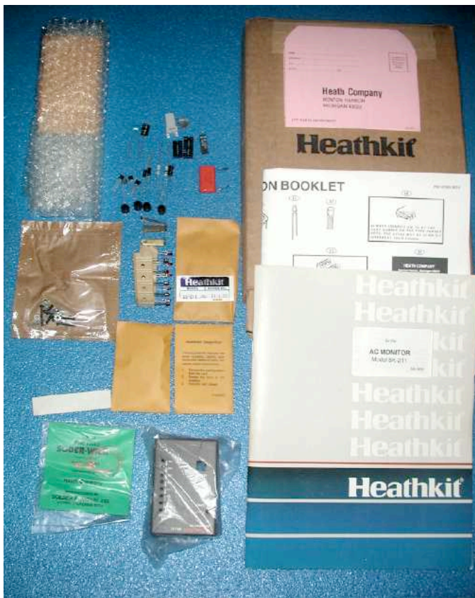
Figure 3: Heathkit SK-211 Unpacked.

This article originally appeared in the January 2014 issue of RF, the newsletter of the Orange County Amateur Radio Club - W6ZE.