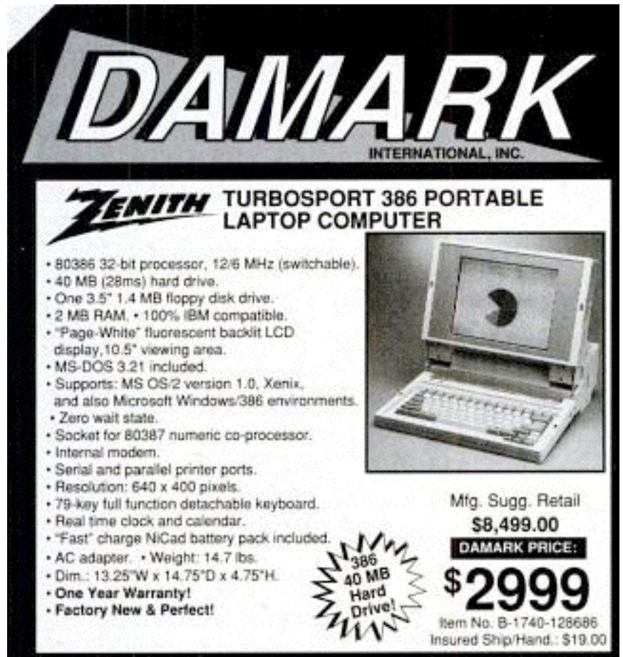
Figure 3: Damark ad in the same February 1990 Popular Science featuring the assembled Heath Zenith computer with modem at almost 65% off.

At this time the computer industry was in a heavy growth mode. The RAM industry was in a turmoil and RAM was just beginning to become readily available after being in short supply. In the Fall 89 catalog