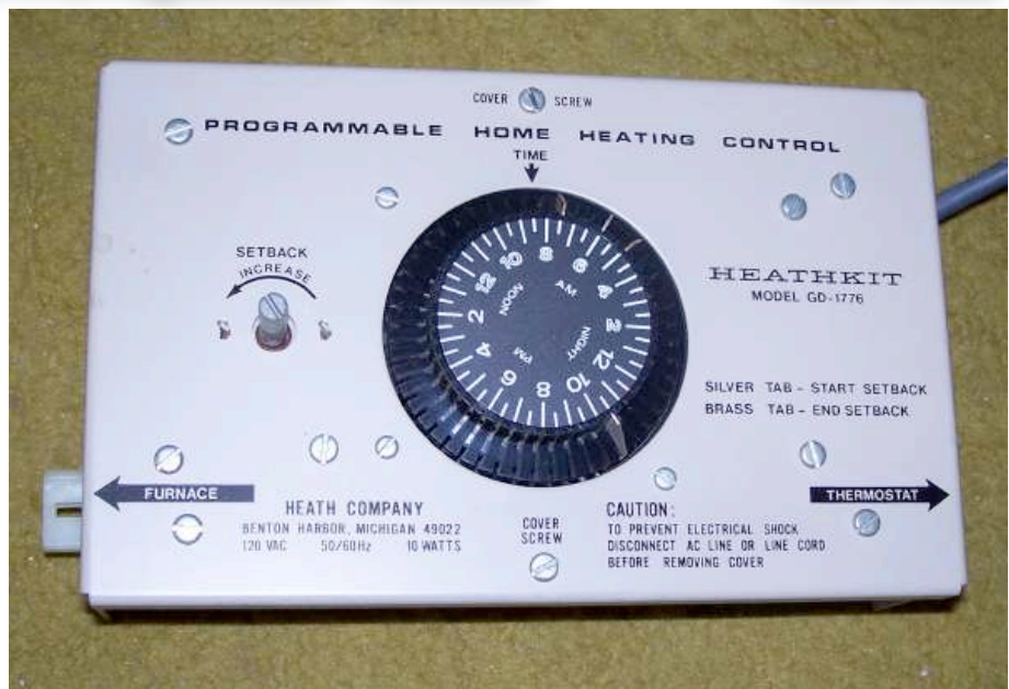
Figure 2: Heathkit GD-1776 Controller Unit

The GD-1776 was listed as “New” in the Spring 1977 factory catalog at a price of $37.95. In the fall 1980 catalog the price had risen to $39.95. How long after that before it was discontinued I was unable to determine. However, on that same 1980 catalog page, Heathkit was offering an assembled GDP-1369 by Robertshaw. This thermostat does everything the GD-1776 does, all built into the thermostat, plus battery backup and air conditioning control. It only cost $10 more than the GD-1776. (The original 1977 GD-1776 ad is shown in Figure 1.)