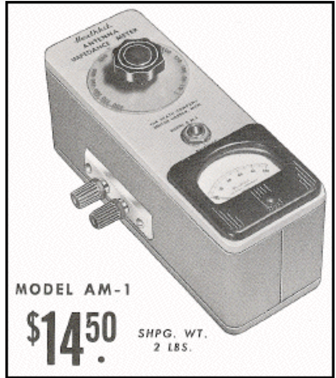
Fig 4: AM-1 from a 1956 Heathkit Catalog

Comments: I built an AM-2 back in 1959 to monitor SWR and help me prune my 40 meter dipole that ran from the house to a pole in the back yard; it