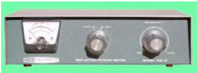
Figure 2: Heathkit HM-15 Reflected Power and S.W.R. Bridge

The HM-15 SWR meter is another redesign of packaging, this time to match the SB series of ham equipment with its wrinkled gray and green design. This SWR bridge is in a low long cabinet with the meter on the left, the FUNCTION switch in the middle and the SENSITIVITY control on the right. The circuit was also slightly changed; the terminating resistor values are different and no longer symmetrical.