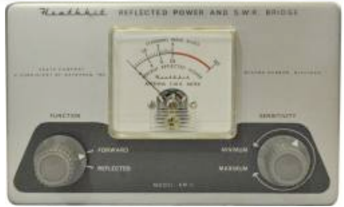
Figure 1: Heathkit AM-2 Reflected Power and S.W.R. Bridge

The AM-2 measures 7-3/8" W x 4-1/8" H x 4-5/8" D and weighs about 1-1/2 lbs. In 1961 it sold for $15.95. The front panel includes a calibrated 100 \mu A meter; a FUNCTION switch to the left of the meter that selects FORWARD or REFLECTED relative power and a 50K linear SENSITIVITY potentiometer to the right of the meter that adjusts the sensitivity between MINIMUM and MAXIMUM . Operation is similar to the typical SWR bridge: Power is sent through the meter and, with the FUNCTION set to FORWARD , the needle is adjusted with the SENSITIVITY control to the SET mark at the right edge of the meter scale; then, without moving the SENSITIVITY control, the FUNCTION switch is changed to REFLECTED and the meter scale is read. The meter has two scales, STANDING WAVE RATIO and PERCENT REFLECTED POWER . Both only go to mid-scale, which represents an SWR of 3.0 : 1