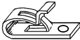
A Fahnestock Clip

I remember building a crystal set as a youngster. It had to have been before I was ten. The kit required you provide your own board and screw a mess of Fahnestock clips into it using a given layout. The board I was given for the project was hard and no drill was available so I had to start the holes with an awl and turn the screws into the hard wood. I found this easier to do without the Fahnestock clip in place which necessitated removing and then reinstalling the screw. The detector was a galena rock in a holder with a "cats-whisker" that you had to move around for the "sweet-spot where it would act as a diode.